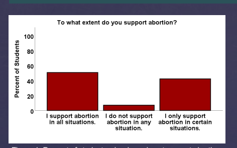
Figure 1: Percent of students who do or do not support abortion in any situation and who support abortion in some situations

Table 1: Scenarios presented to students who chose "I only support abortion in certain situations." Students were asked to check which scenarios for which they would support abortion.