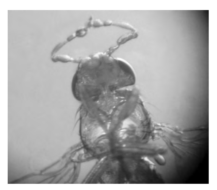
Figure 3. Drosophila with antp mutation. Note leg-like structures on the head.

As mentioned above, some genes involved in A. mexicanus eye development are also pleiotropic, that is, a single gene impacts more than one recognizable trait. For example, the overexpression of the genes sonic hedgehog (shh) and tiggy-winkle hedgehog (twhh)—which are both homeotic genes (genes that encode transcription factors that often control an entire developmental pathway) in A. mexicanus-results in degradation of the lens of the eye, but it also results in an increase in the size of the fish's jaws and in the number of taste buds on the lips (Retaux & Casane, 2013; Protas et al., 2007). In fact, such a gene would also be considered pleiotropic because it has multiple phenotypic effects (on the eye and the mouth). Note that regulatory genetic effects tend to be qualitative, not quantitative, that is, the mutation of a single gene, not many genes, is typically sufficient to determine the effect. Thus, shh is likely to have its effect "upstream" in development, that is, prior to the actions of the structural genes described above.