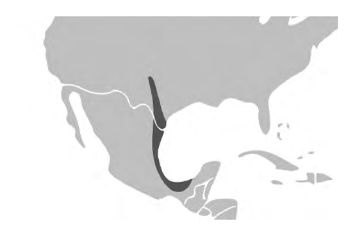
Figure 2. Distribution map for Astyanax mexicanus.

of bacteria that break down bat and cricket guano (feces), although sometimes flooding brings in additional biomass food (Leighton, 2015; Gross, 2012). Darkness also means that finding mates is more difficult. Mating and sexual selection in most animal species is often based on coloration, but troglodyte species typically have no coloration. Astynanax (as-tie'-a-naks) individuals find mates through their enhanced tactile senses; they have greater ability to sense vibration. In fact, scientists capture these fish simply by putting a net in the water and vibrating it.