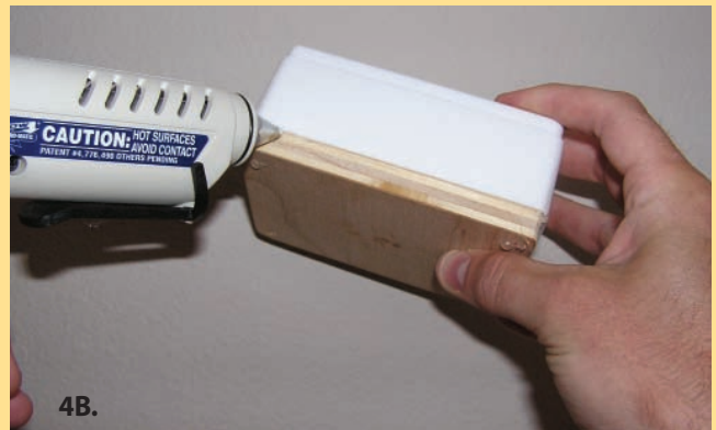
Figure 4A. The pipet tip box is placed over a piece of \frac{3}{4} " plywood cut to size. 4B. It is secured in place with hot glue.

Connect a length of rubber tubing from the regulator on a CO 2 tank to the aquarium valve using polypropylene connecting tubes as needed (Figure 1). Run plastic tubing from the aquarium valve to individual platforms. In some cases, a fitting reducer is needed if the CO 2 tank valve and the aquarium valve are different sizes. We color code the aquarium valve and platforms with colored tape so we can quickly identify which valve feeds which platform. Adequate CO 2 flow exists if you can feel the gas lightly diffusing through the platform with the back of your hand or if you hear it lightly hissing if you hold the platform next to your ear. If the flies are visibly moved by the gas diffusing through the platforms, the flow may be too high. Conversely, if flies resuscitate and begin to walk around, adjust the valve to increase the flow of gas which should immediately immobilize them. Once the gas level is set, the platforms may be placed under dissecting microscopes for observation and manipulation of Drosophila .