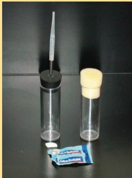
Figure 6. An alternative apparatus for initially anesthetizing Drosophila . Alka-Seltzer and 100 ml of water are added to culture tube on the left. The rubber stopper (with a hole into which a glass tube and pipet tip have been inserted) is placed over the culture tube. The \text{CO}_2 generated may be directed into a culture tube containing Drosophila .

An alternative apparatus for initially anesthetizing Drosophila in their culture tubes can be constructed from an empty culture tube, a rubber stopper with a hole in it, a glass tube about 8 cm in length, and a disposable plastic pipet tip cut to about 8 cm in length (Figure 6). Insert the glass tubing into the hole in the stopper and fit the plastic pipet tip over the tube. Add water to the empty culture tube until it is roughly \frac{1}{4} full. Add half of a tablet of Alka-Seltzer and quickly seal with the rubber stopper. As the Alka-Seltzer dissolves, it releases \text{CO}_2 . Carefully turn upside down the vial containing the fruit flies (ensuring that the fruit fly culture medium doesn't dislodge). Insert the pipet tip into the culture tube containing the Drosophila between the foam stopper. As the \text{CO}_2 is produced, it is vented into the culture tube containing the Drosophila . When all the flies are anesthetized, remove the pipet tip, remove the foam stopper, and carefully shake the flies onto the anesthetizing platform.