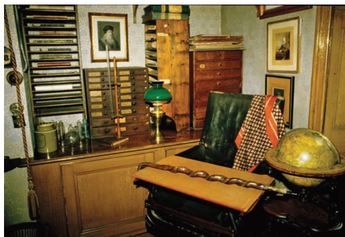
Figure 1. Image of part of Charles Darwin’s study at Down House, located in the village of Downe, about 25 km south-east of central London. Darwin lived and worked in this house from 1842 until his death in 1882. When not experimenting in his greenhouse or hiking his “thinking path,” he often worked at this special rolling chair with writing table, where he wrote most of his iconic works.

Darwin was alternately delighted and challenged by his pangenesis insights. He wrote an entire chapter in the book Variation of Animals and Plants under Domestication (1868b and 1875), talked extensively about the principle in Descent of Man (1871 and 1874), mentioned pangenesis in much correspondence with colleagues, but, curiously, failed to include mention in any edition of On the Origin of Species . In spite of its